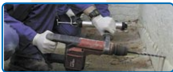
DRYZONE 's fast, clean, effective application by experienced professionals

Since the 1950s, liquid chemical injection systems, which work in a similar way, have been used with a high degree of success. However, from the householders point of view, Dryzone has a number of important advantages over these systems: